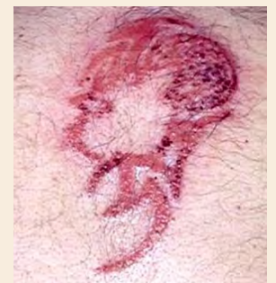
An adverse reaction to a 'black henna' tattoo

True henna extract is orange-red in colour. 'Black henna' tattoos are not pure henna. They have been mixed with a chemical called paraphenylenediamine, or 'PPD'. This use of PPD is illegal as it can be very harmful if applied direct to your skin in such high concentrations. It can leave you with a swollen, sore, red 'burn' and can sensitise you to PPD. This means you could react strongly to otherwise safe products such as hair colorants which also contain PPD. Hair colorants themselves are regulated under the stringent EU cosmetic safety regulations and are perfectly safe to use if the instructions are followed carefully.